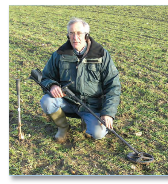
The author with the Déus on a cold day.

What do you think takes up the most space and is also the major weight factor in a control box? Yes, of course, the batteries. The accepted norm has been 12 volts and in the past it has been necessary not only for the power output, but also for the longevity of detecting hours. However, with technological strides made recently, would it be possible to use very compact, high-capacity lithium batteries? Yes, with an ultra miniature electronic circuitry. So now the remote, the coil and the headphones have their own identical power source. But how long will the batteries last? In the past it has generally been the practice of having to charge the batteries for at least an overnight period of time. Not looking so good? No, each of the three elements can also be charged separately if required. Another feature of lithium polymer batteries is that they can be quickly charged without developing a memory. Charging time for the remote and headphones is 2 hours when completely flat, the coil is just 90 minutes. Looking good, but how long do they last? Between 9 and 10