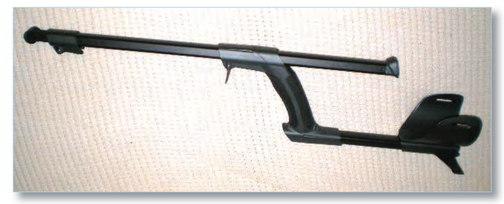
Handgrip/arm-cup, cam-locks, and shafts.

This is an important part of the design as it makes each unit independent for its power source.