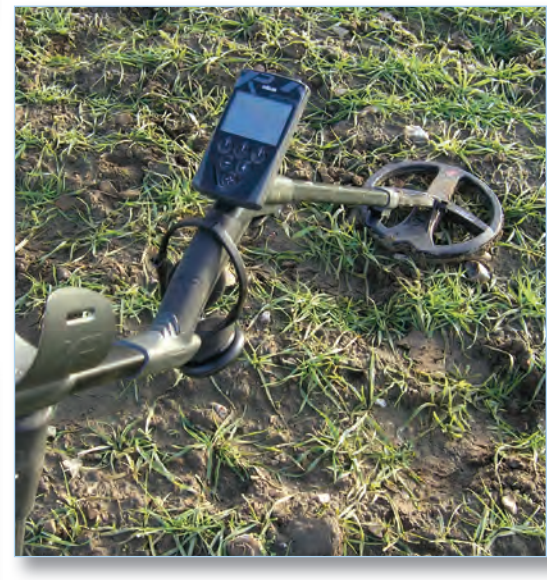
Remote control on magnetic head of shaft.

Think about that for a minute, a battery, and electronic circuitry in the coil?