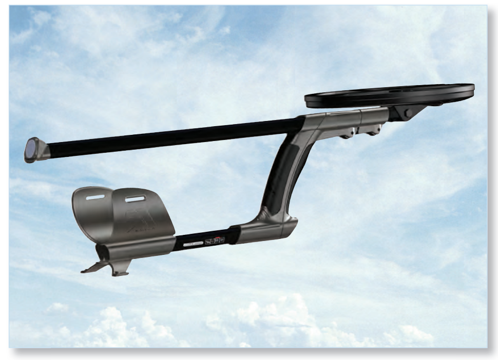
Déus "Starship Enterprise".

This definitely isn't one of those machines that have been rehashed using existing technology, quickly produced