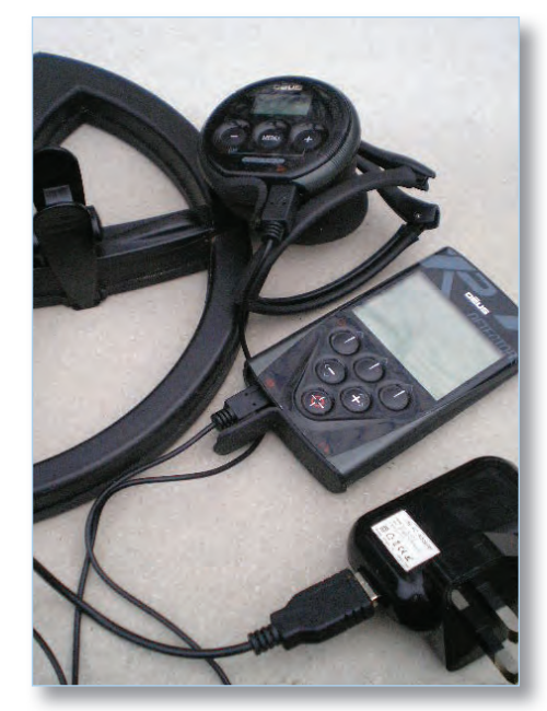
Charging the units.

When both shafts are fully retracted for easy carrying purposes, the whole detector reduces to just 2 feet 2 inches; less than the length of an average foot assisted trowel! Now ally that to the fact that the Déus weighs in at just 875 grams making it just about the lightest detector (serious ones, not toys!) on the market today.